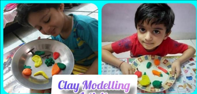
Clay Modelling Activity