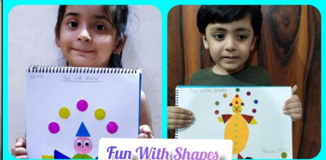
Fun With Shapes Activity