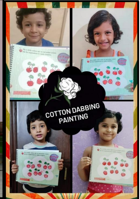
COTTON DABBING PAINTING