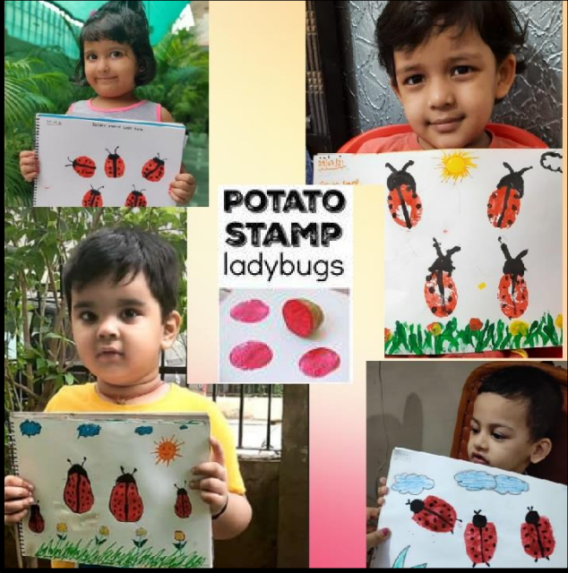
POTATO STAMP ladybugs