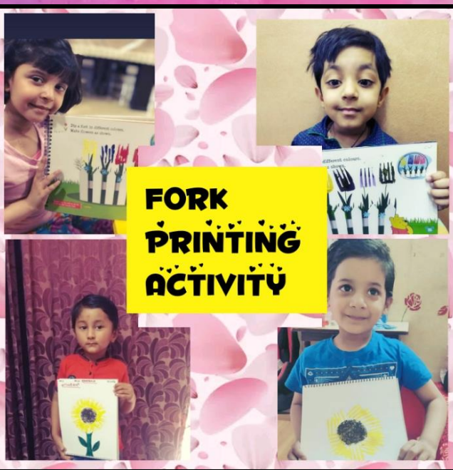
FORK PRINTING ACTIVITY